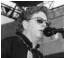
Everyone is invited to Folk Festival 2002 at UMass Boston, Sept. 21 - 22. Details on page 6.