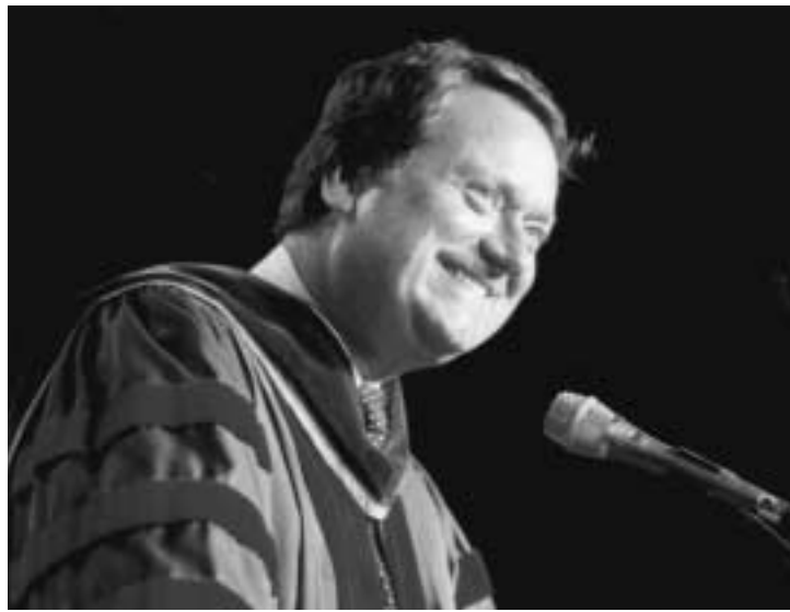
The "Dean" of broadcast journalism, Tim Russert addressed over 2,500 new university alumni at Commencement 2002.