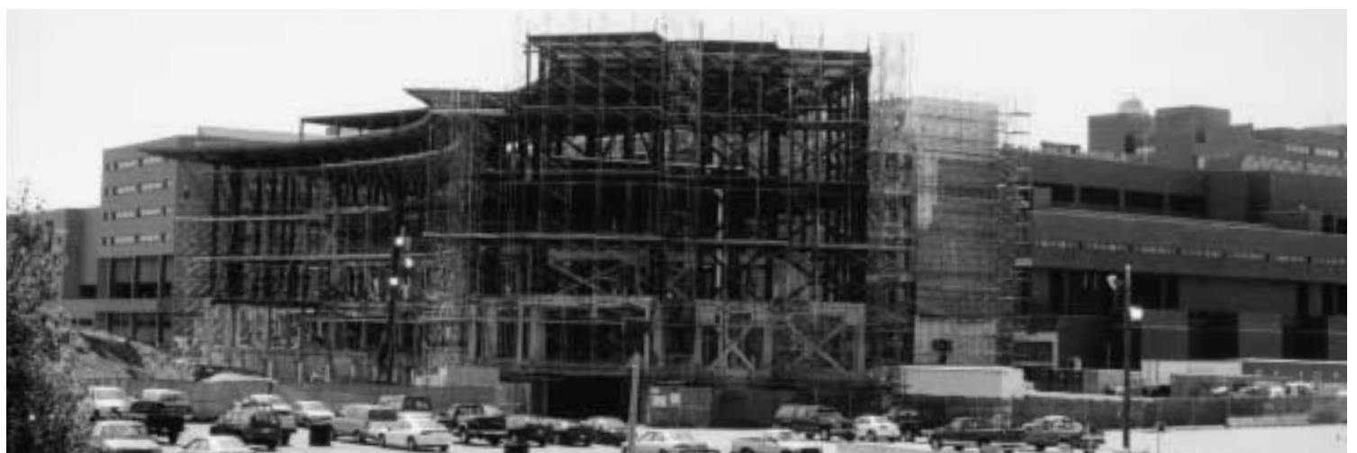
The 331,000 square foot Campus Center will face Boston Harbor and serve as the new front door to the campus.

All told, 1,788 undergraduate students and 737 graduate students received their degrees and joined the ranks of over 72,000 UMass Boston alumni. UMass Boston awards the BA, BS, MA, MBA, MEd, MBA/MS, MS, PhD, and EdD degree, and a number of undergraduate and graduate certificates.