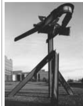
Answer? See page 6.

Enrollment Management UMass Boston 100 Morrissey Boulevard Boston, MA 02125-3393