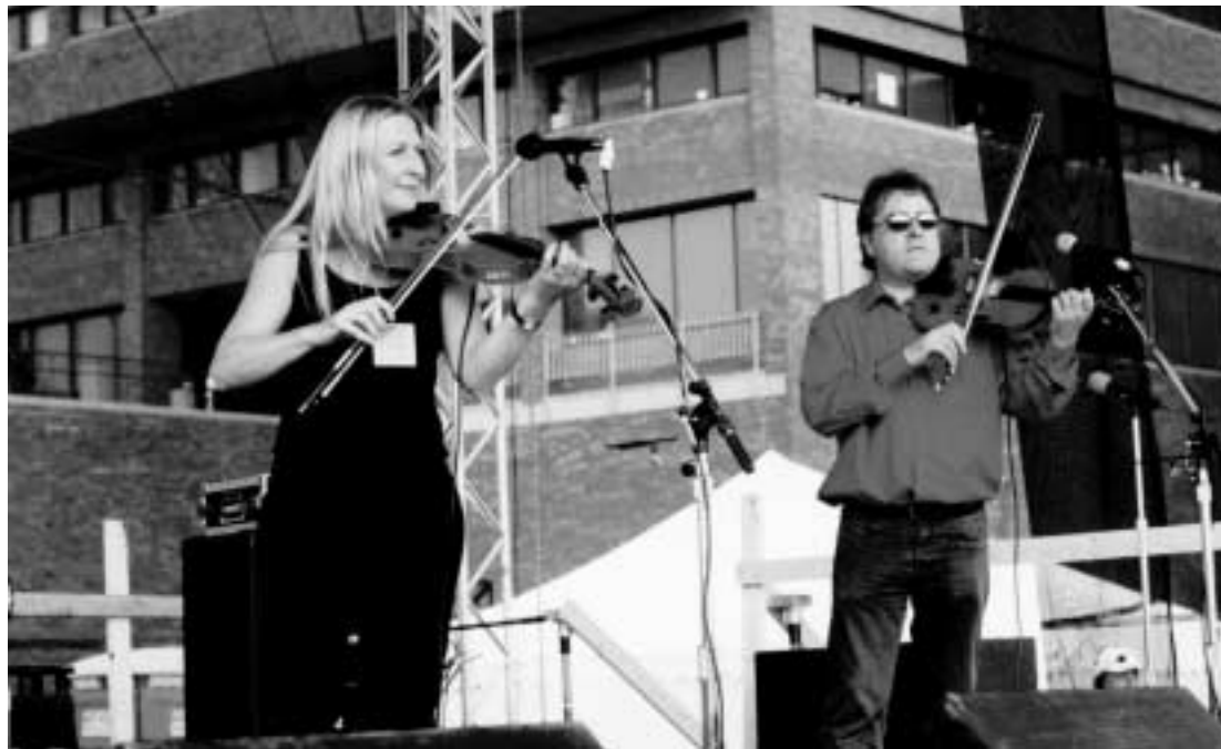
Despite the events of Sept. 11 a week earlier, Folk Festival 2001 drew thousands who celebrated American folk music.